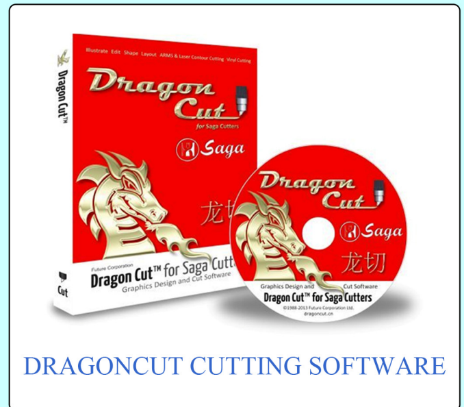
DRAGONCUT CUTTING SOFTWARE